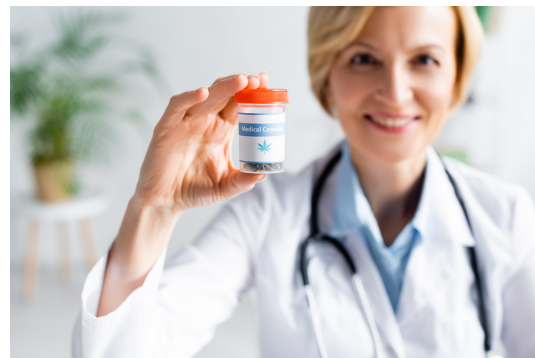
A doctor holds a bottle of medical cannabis

For questions about the Utah Medical Cannabis Program, email: medicalcannabis@utah.gov