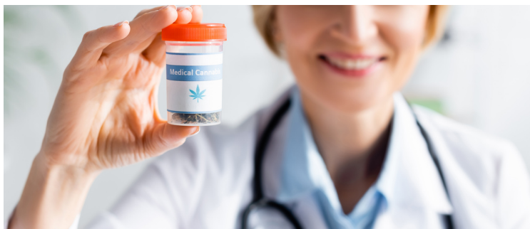
A doctor with a stethoscope holding a container that says "Medical Cannabis".

Contact cubcmc@utah.gov if you have any questions about the new CUB petition.