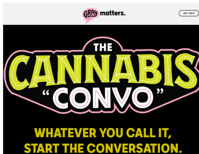
A screenshot from the Gray Matters website

Education materials about preventing teenage marijuana misuse can be found at https://graymattersutah.org/ .