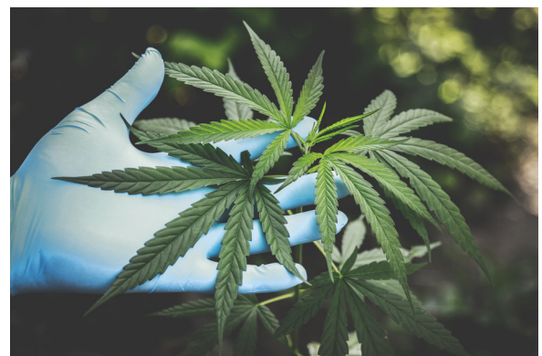
A gloved hand holding cannabis leaves