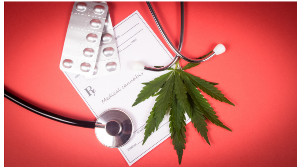
A cannabis leaf, stethoscope, pill packs, and a piece of paper for a medical cannabis Rx are laying on a red background.