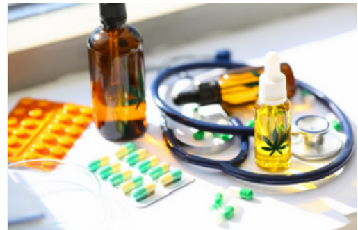
A variety of medical cannabis products are on a desk with a stethoscope.