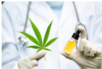
A person with a white coat and stethoscope holding a cannabis leaf in one hand and a tincture in the other