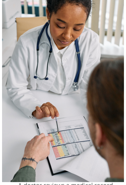
A doctor reviews a medical record with a patient.

A list of DHHS licensed medical cannabis pharmacies can be found at medicalcannabis.utah.gov/pharmacies.